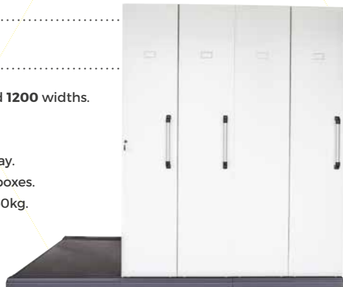
SINGLE DOUBLE SINGLE *STARTER UNIT