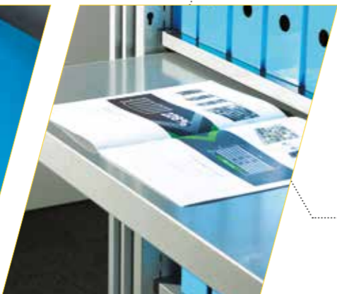
Pull Out Shelf