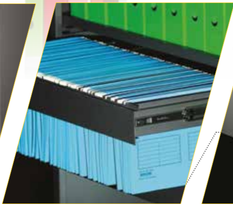
Pull Out Filing Frame