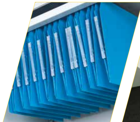
Lateral Filing Rail