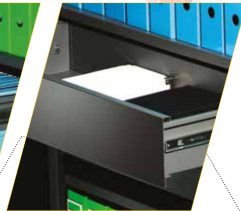
Pull Out Drawer